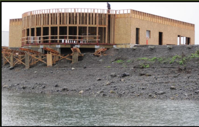
New Harbor Office