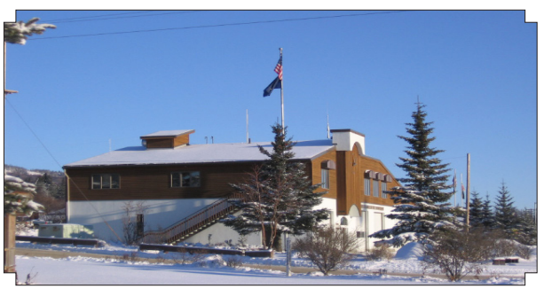
Homer Fire Station