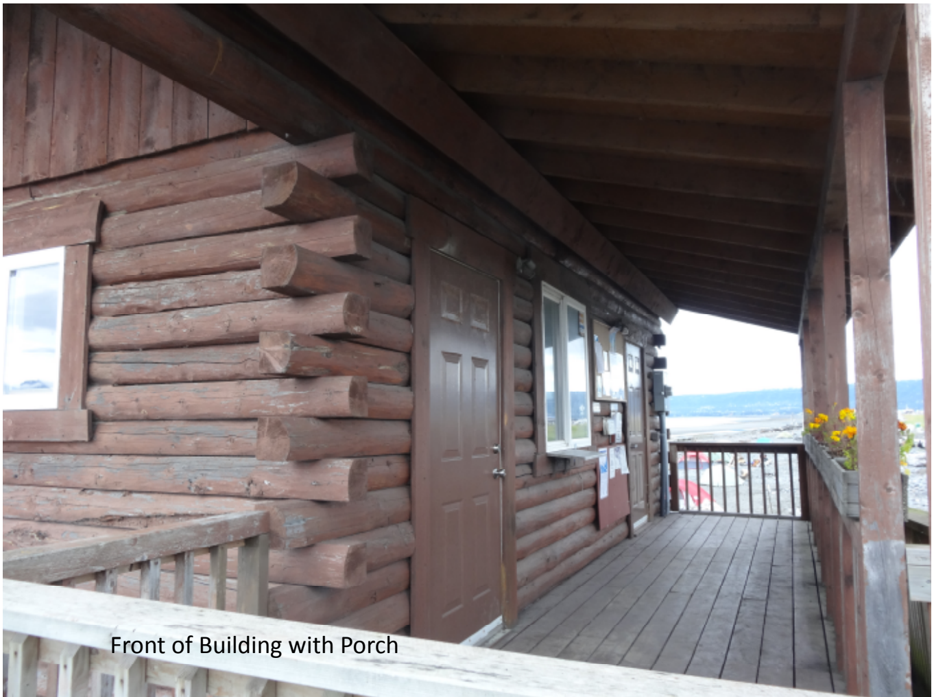
Front of Building with Porch