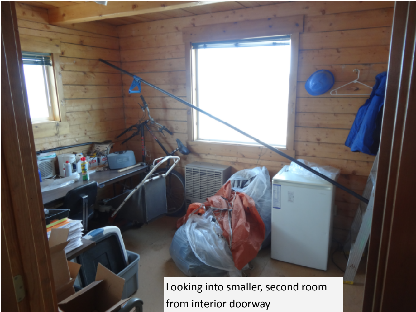
Looking into smaller, second room from interior doorway