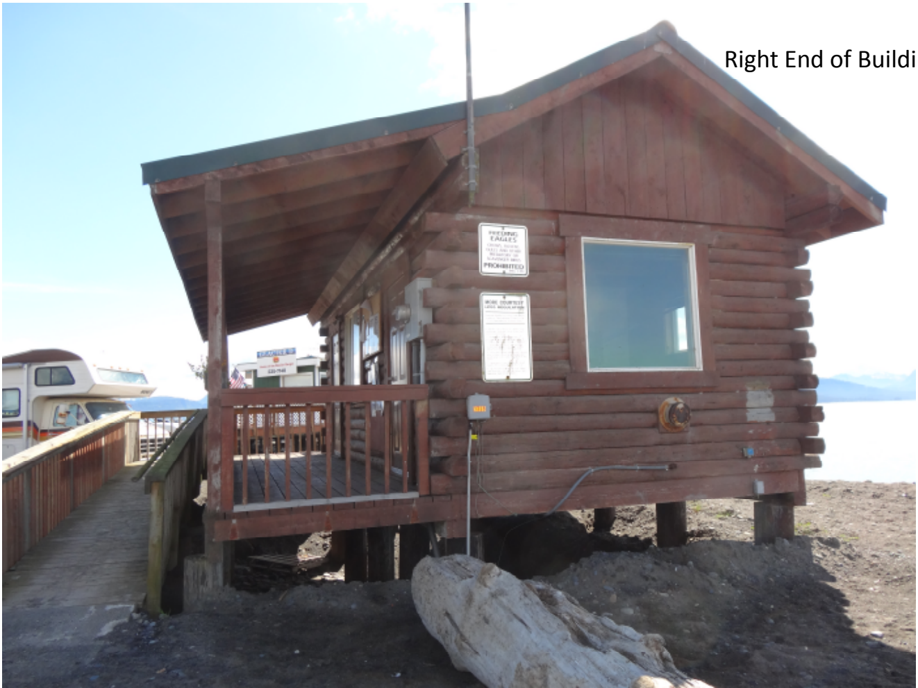
Right End of Building