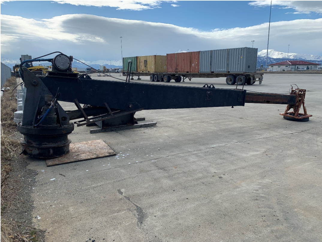
Item #2 Anchor Winch, Aurora model AWT2, minimum bid is $1000