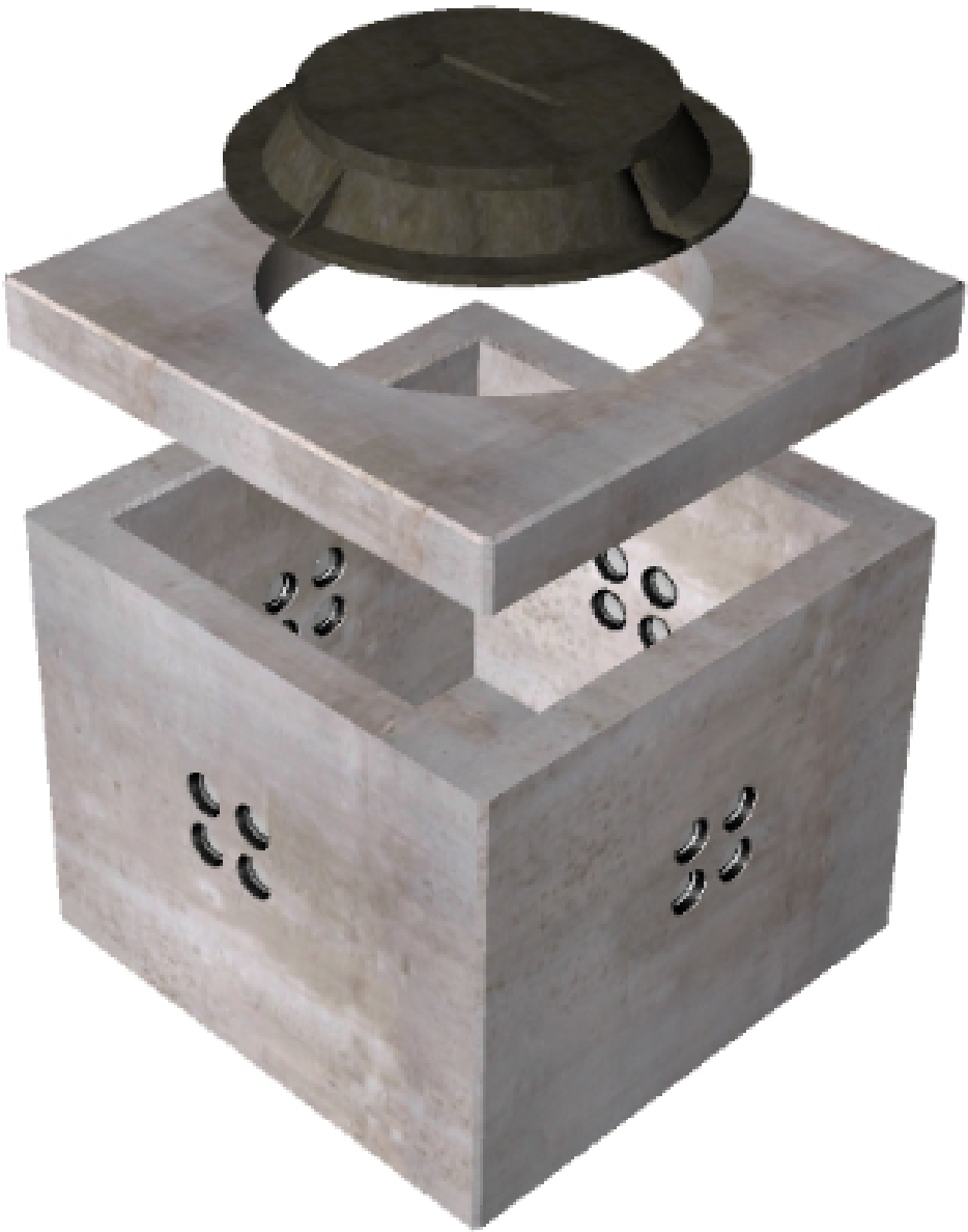
TYPICAL 3' X 3' X 3' COMMUNICATIONS VAULT (OLDCASTLE INFRASTRUCTURE OR SIMILIAR)

SM6 TUBE 12 FIBER OPTIC CABLE IN 2" HDPE CONDUIT. 36 INCHES MINIMUM BURY.