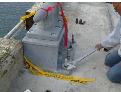
New DWD Cleat

this project was completed this year by installing additional cleats on the Deep Water Dock (to improve ship berthing), replacement of the mooring buoy (located near the entrance to the Small Boat Harbor), eliminating trip hazards on the dock, and installing bird nesting deterrents on the dock approach. Also interpretive/educational signage was placed around the harbor trail to remind visitors about the unique aspects of the harbor and Kachemak Bay. (Project cost = $120,000) Funded by Cruise Ship Passenger Head Tax Grant.