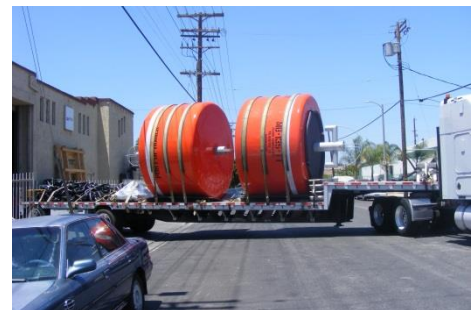
delivery of new mooring buoys