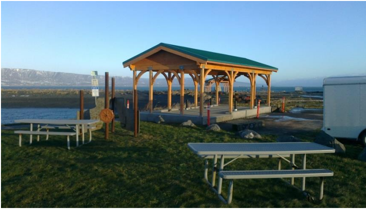
New structure over cleaning tables