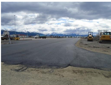
New paved access road to the DWD Dock

- this project consisted of the construction of a paved access road, demolition of wall around the old chip pad, new fencing, lighting, and security camera installation to improve cargo laydown and storage facilities supporting the Deep Water Dock. (Project cost = $1,000,000). Funded by a State Legislative Grant. These improvements were recommended in the draft DWD expansion feasibility report.