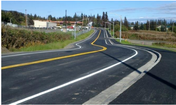
Waddell Way Improvements