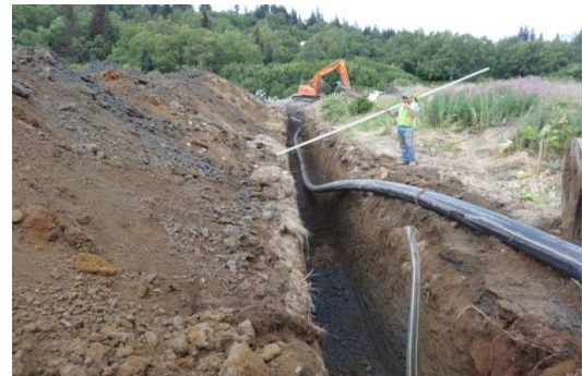
Shellfish Avenue Water Main Installation

– this project consisted of the construction of 2600 LF of 8” and 10” water main; and a pressure reducing station. (Project cost = $900,000). Funded by ADEC/EPA Grant and Homer Accelerated Water/Sewer Program (HAWSP). The project provides backup water service to the Hospital and the pressure zone west.