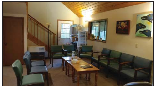
The Annex's group treatment space needs remodeling to make the space more private and separate from a public entrance, public bathroom and stairway to offices..