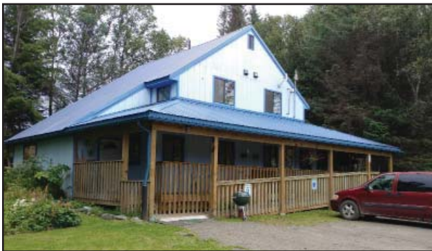
Annual maintenance to the Annex, an older, former residential building that houses several SPBHS programs, often exceeds SPBHS' entire agency maintenance budget.

Schedule: September 2017-September 2019. We are hoping to coincide the grand re-opening of The Annex with SPBHS's 40th anniversary celebration.