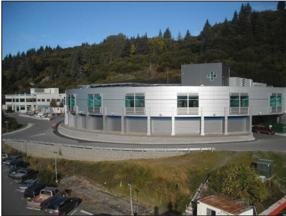
A hillside stability study on the slope behind the South Peninsula Hospital will yield recommendations on ways to minimize risk to the facility.