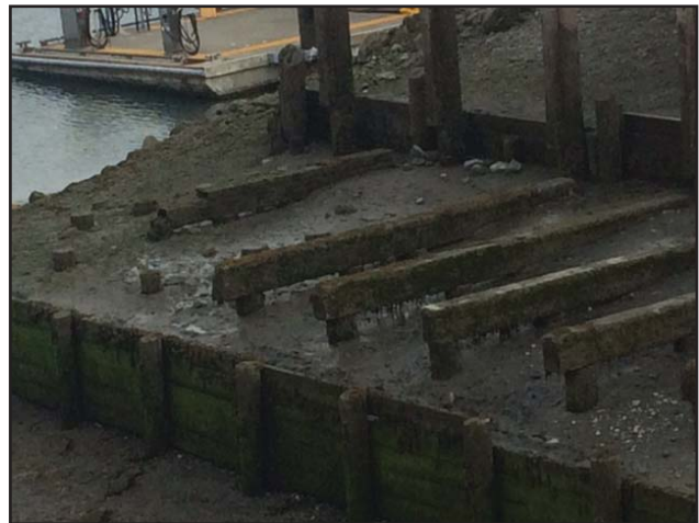
The Wood Grid in Homer’s Port and Harbor was originally built 40 years ago and accommodates vessels up to 59 feet with a 50 ton limit. Other than replacing the walkway in 2001, the wood grid has seen very little in terms of upgrades since.