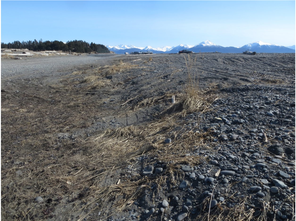
The lower, inner part of the outer storm berm has remnants of grass and vegetation.