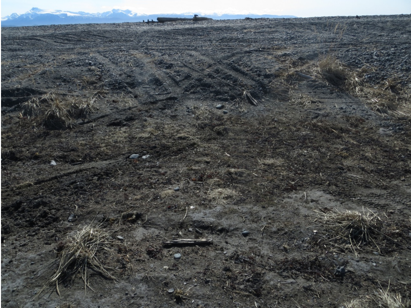
Close up of the area shown in photo above illustrates vehicle damage to vegetate areas.