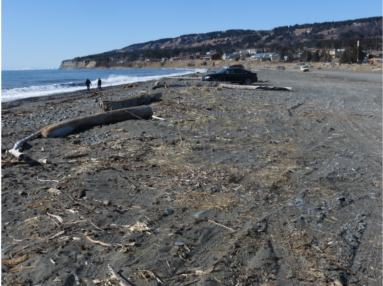
Struggling patches of grass still exist between areas where cars have been parked.