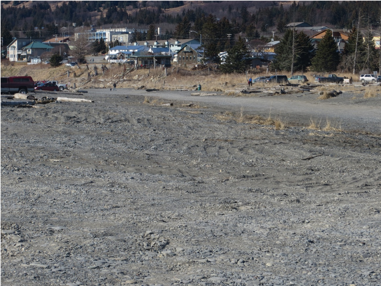
Next to the compacted driven area are pockets of grass and other vegetation.