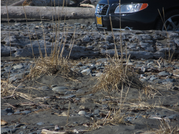
Closeups of some of the grass in the larger photo above.