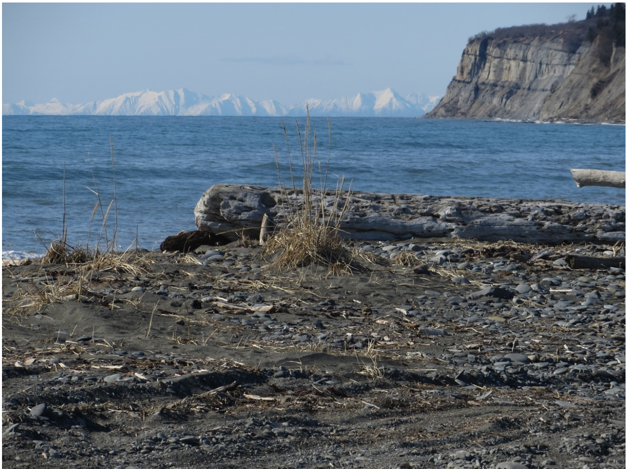
Tufts of beach grass are surviving among all the car tracks on the storm berm in zone 7.

I also believe in the interest of protecting the habitat and wildlife that use USFWS land in Zone 7, this area should become a year-round dogs on leash only area. I support more education about picking up dog feces on the beach and around town. The City should provide more trash containers and bags for dog walkers.