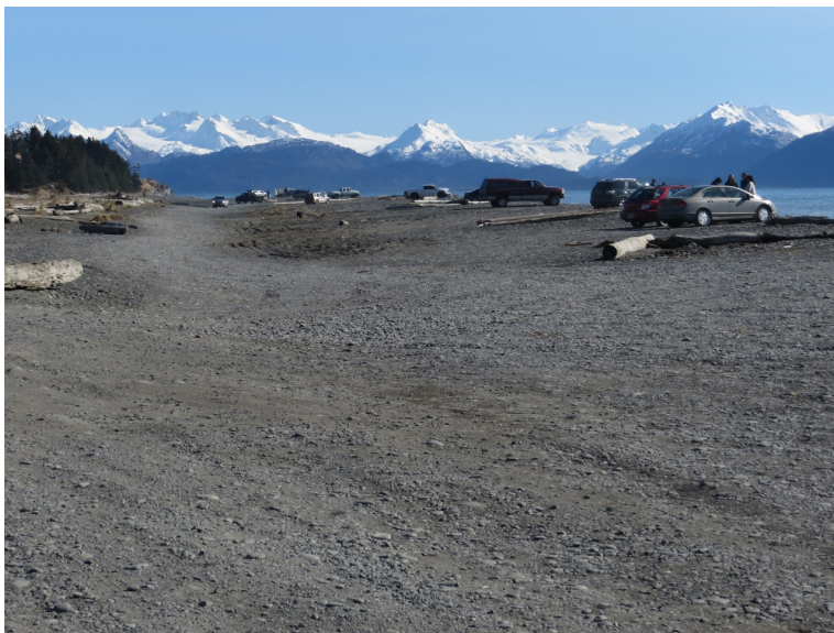
So many cars are damaging the berm now, vegetation can hardly survive.