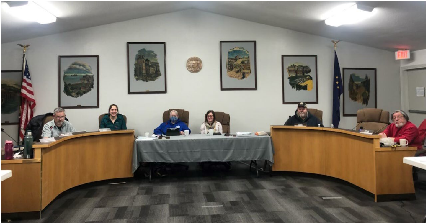
Seldovia City Council at the repurposed Homer dais

In August of 2021, the City Council endorsed a donation of the dais formerly in Council Chambers to the City of Seldovia (see Memorandum 21-144). We held the dais in storage at the HERC until Seldovia was able to make the arrangements to ship it across the bay. The dais is now in use for in-person meetings at Seldovia City Hall.