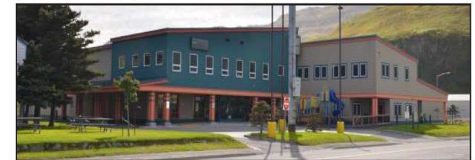
The City of Unalaska's Community Center is the hub of community activities. Centrally located, the Community Center is widely used by both residents and visitors. It has everything from a cardio and weight room to music and art areas.

FY2023 State Request: $425,000 (City of Homer 15% Match: $75,000)