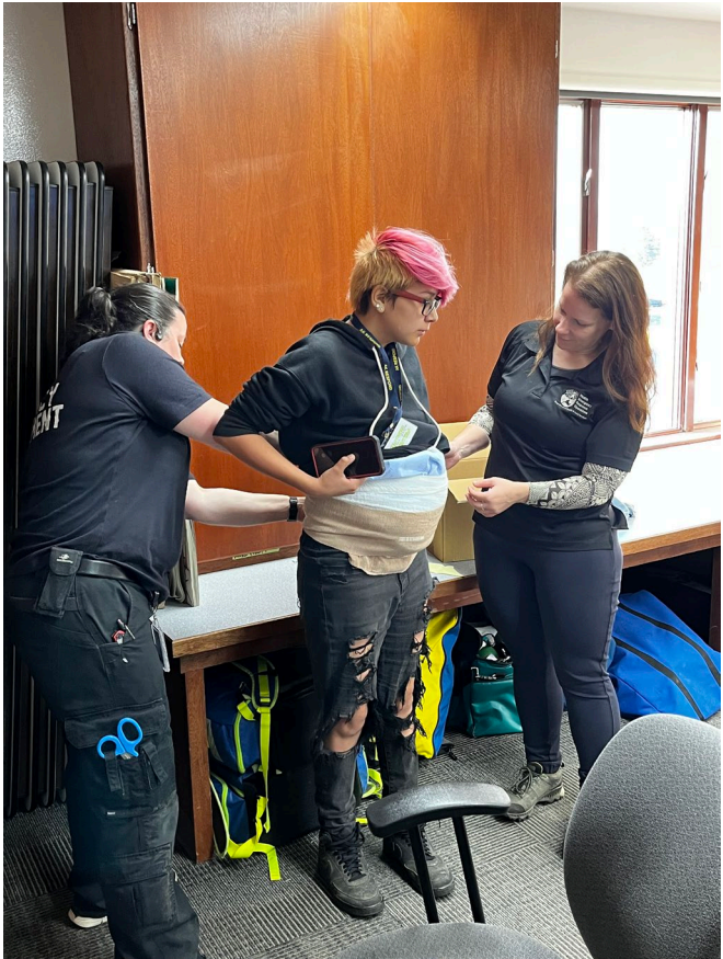
Making a student up as a pregnant person with injuries