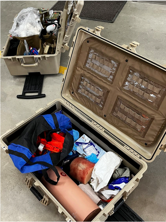
Make-up kits for simulating injuries