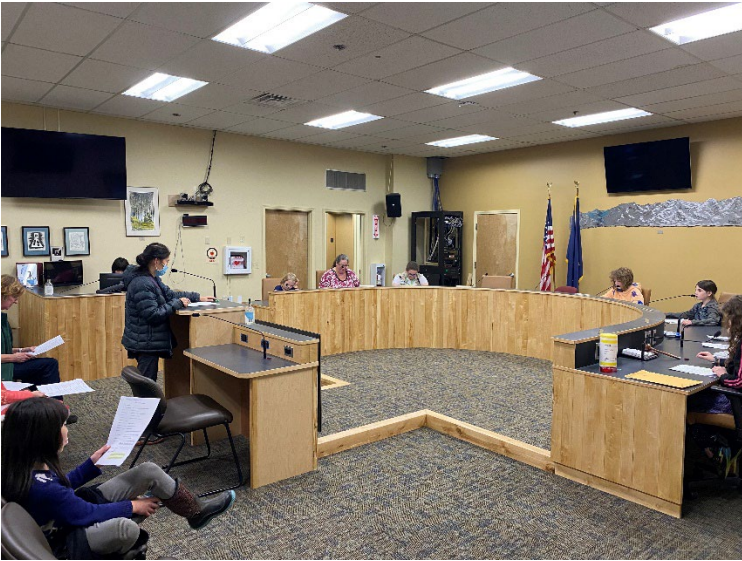
Mock Council Meeting