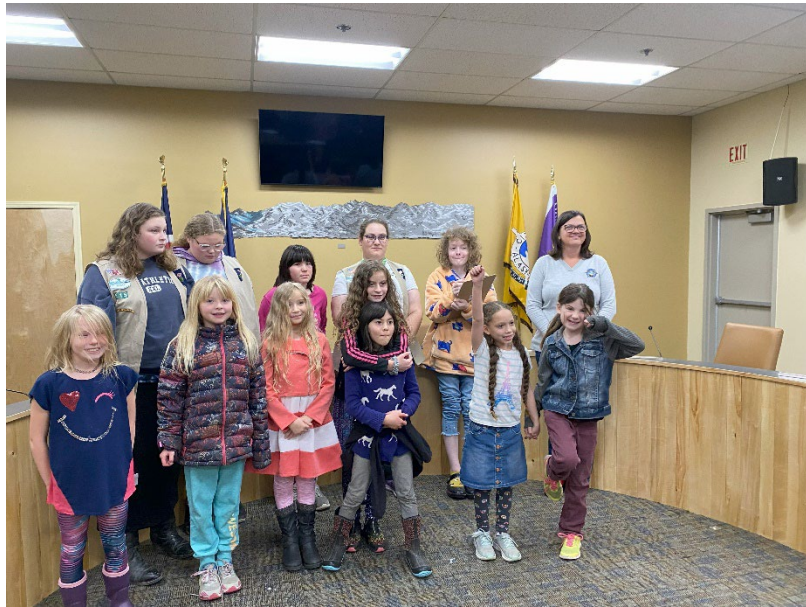
The Girl Scouts