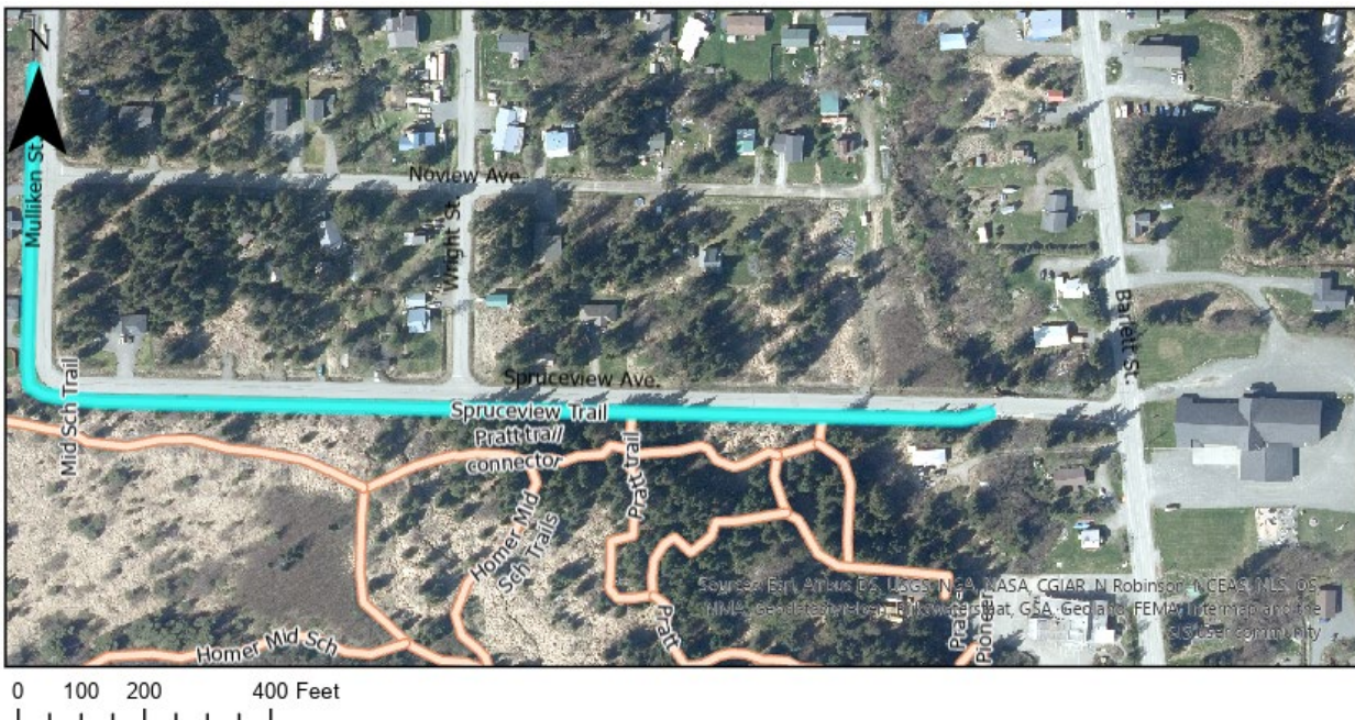
Spruceview Trail-brush hogged both sides, done in house