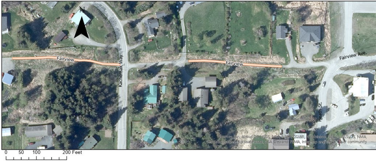
East Fairview & West Fairview-redone with new fabric and material by contractor