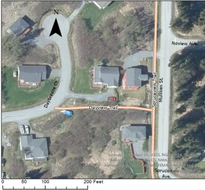
Day view Trail-brush hogged sides, done in house