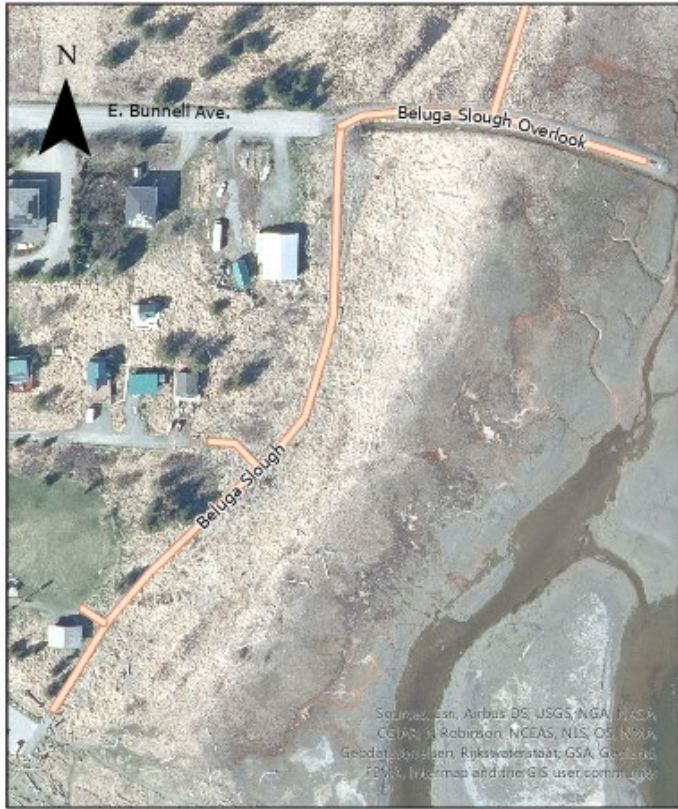
Beluga Slough Trail-ADA approaches were installed at each entry point