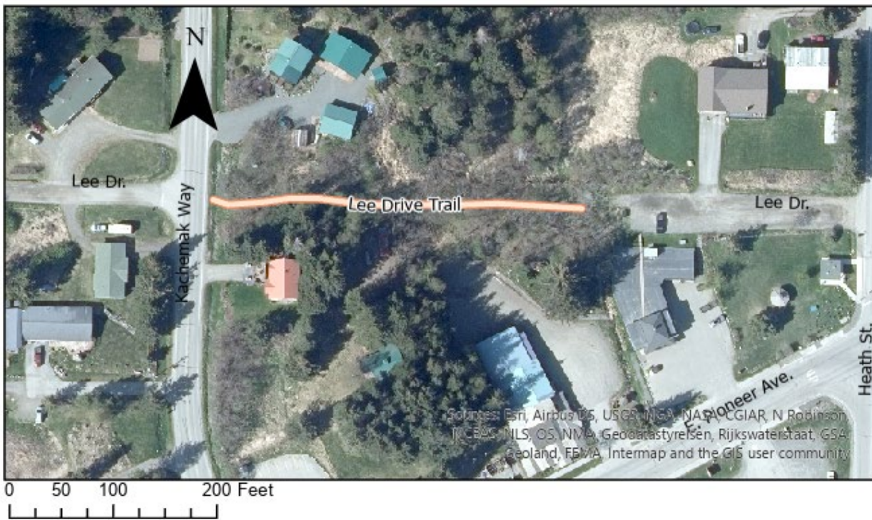
Lee Drive Trail-installed with new fabric and material by contractor