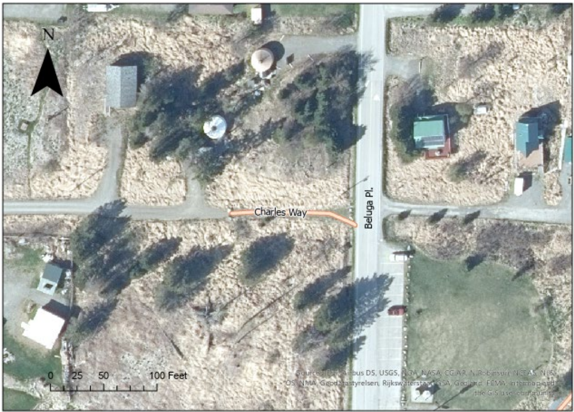
Charles Way-Installed with water/sewer by contractor