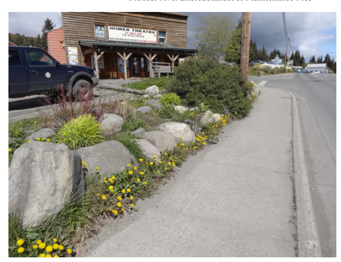
Pioneer Ave. Encroachment & Maintenance Pics