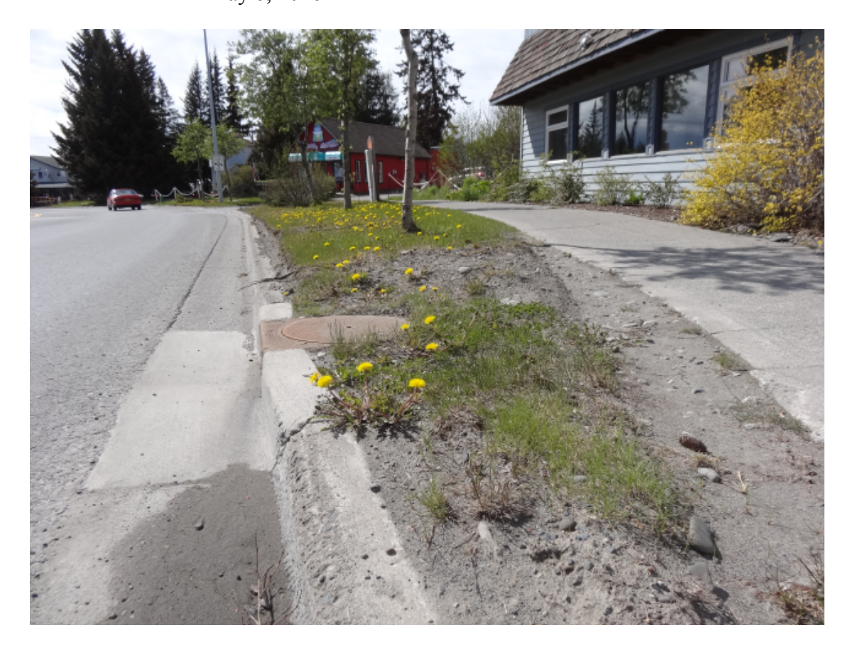
Raised sod in front of Homer Insurance 270 W. Pioneer