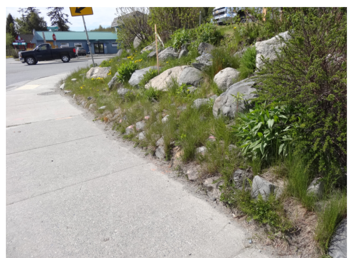
Pioneer Ave. Encroachment & Maintenance Pics May 6, 2016

Rocks at edge of sidewalk At VBS Heating