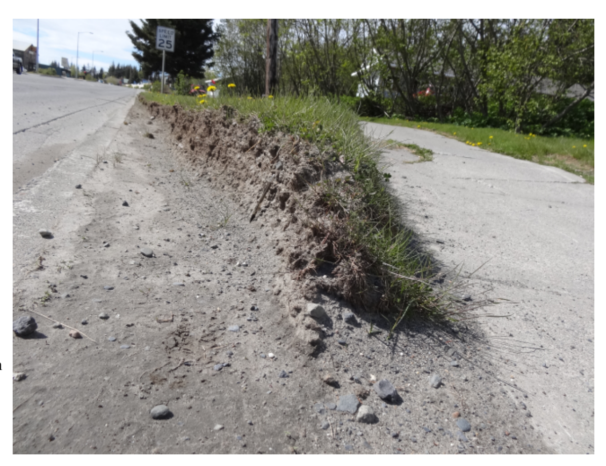
Pioneer Ave. Encroachment & Maintenance Pics May 6, 2016