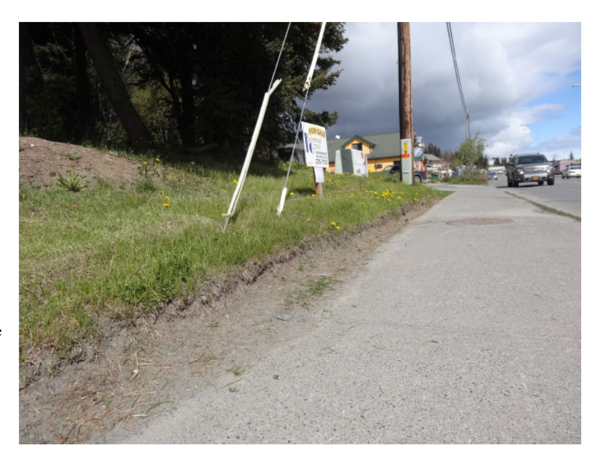
Pioneer Ave. Encroachment & Maintenance Pics May 6, 2016

Pics of raised sod at lot west of Cups and east of Frame Gallery