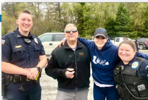
Homer's finest at the 2021 Torch Run.