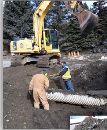
Left: Crew backfilling trench after repairing the sewer service line on Kachemak Way.