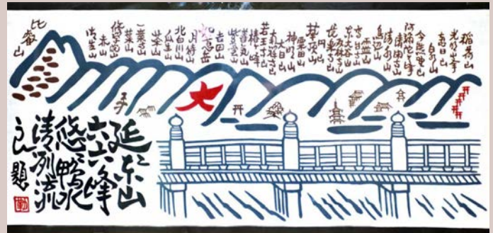
Teshio, Japan Artwork Collection, 2002 City Clerk's Office, City Hall

www.cityofhomer-ak.gov/ prac/city-homer-municipal-art-collection