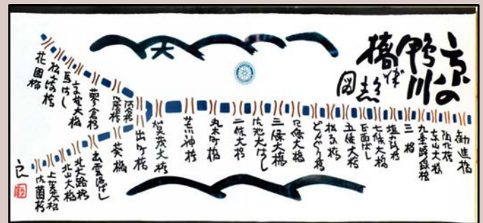
Teshio, Japan Artwork Collection, 2002 City Clerk's Office, City Hall