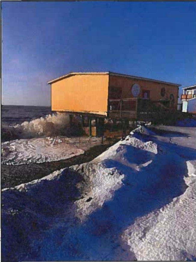
Bank erosion is threatening foundational piers on commercial properties.