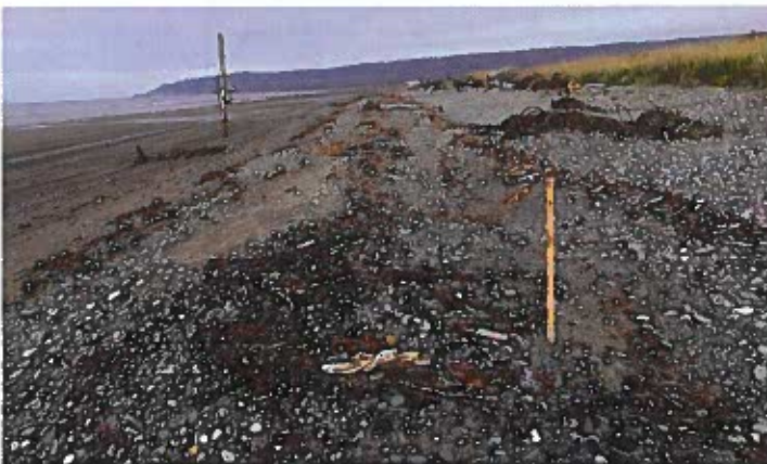
The City of Homer has placed dredge materials at this site to partially reclaim a city campsite area on the Homer Spit. The placement of this material also provides a buffer for the highway embankment in this area.