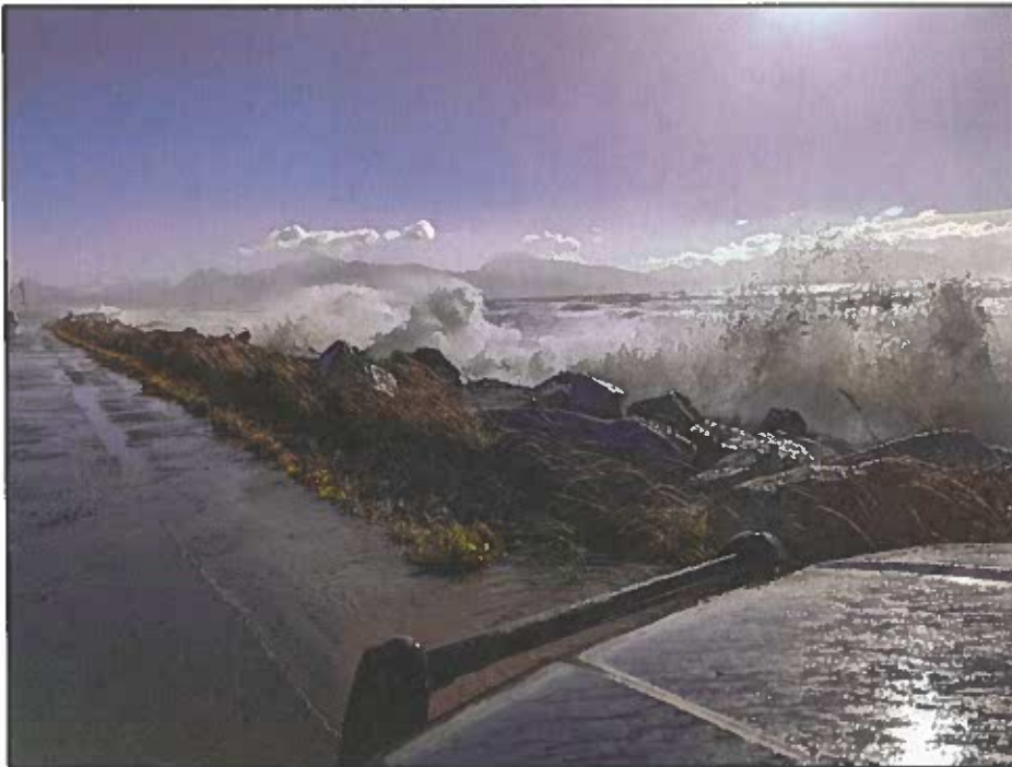
2022: Kachemak Bay waves topping the rock revetments protecting Homer Spit Road.