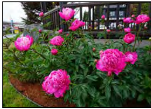
"Peonies on Pioneer" --in gardens and murals-- are a visual treat when exploring Homer's Pioneer Avenue business and shopping district.

Vibrant Arts Scene - With so many arts events to attend and participate in, Homer residents have to plan ahead to make time to stay home! Local galleries present monthly First Friday art exhibits, and two arts centers promote visual, literary and performing arts through a variety of workshops and programs. Throughout the year, bands can be heard most weekends at Homer's venues -- both local and world renowned--as Homer is a regular stop on Alaska's concert circuit, and also hosts the World Arts Festival annually each fall. Pier One Theatre comes alive in the summer with plays, from side-splitting comedies to thought-provoking dramas to musicals, all top-notch productions performed by local actors and actresses that often sell out the house.