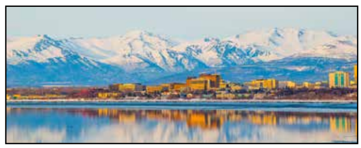
Downtown Anchorage at sunset on a clear day.

Vacationing in Alaska is a great way to learn about the state, and explore job opportunities. Alaska is vast, stretching thousands of miles in all directions, with starkly contrasting climate zones, breathtakingly beautiful scenery, abundant wildlife, and Native people with rich cultures. It presents abundant and varied recreational opportunities. No wonder it is a prime tourist destination! Come for a visit, savor the flavor of various communities, experience the weather, and check out the job scene. Remember to include Homer on your itinerary! @VisitHomer on FaceBook shares visitors' stories about Homer. Let them inspire you, too!