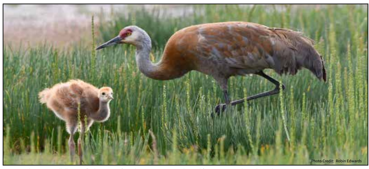
Every April, Lesser Sandhill Cranes flock to Homer from their wintering grounds in California to nest and rear their colts.

Homer is a caring community. Many residents are committed to making Homer a better place and give generously of their time and talents to contribute to overall quality of life. New residents have many opportunities to join civic, non-profit and grassroots organizations, which bring neighbors together to help those less fortunate, create solutions for shared concerns and complete civic projects.