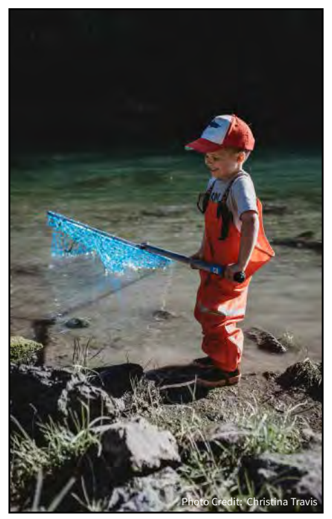
Young fisherman enjoying the day's outing.