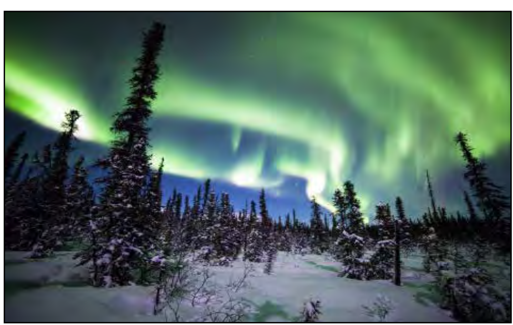
The aurora borealis (or northern lights) brighten Alaska's winter nights.

Renewable energy options such as solar electric, solar thermal and geothermal supplement traditional energy sources.