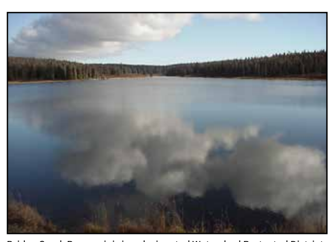
Bridge Creek Reservoir is in a designated Watershed Protected District to insure Homer's quality drinking water for the long term.