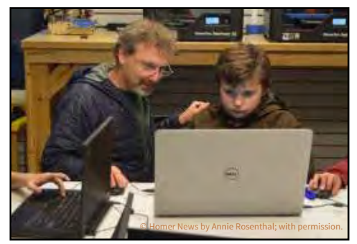
Designing a boat to be printed from the Maker Space's 3D printers.