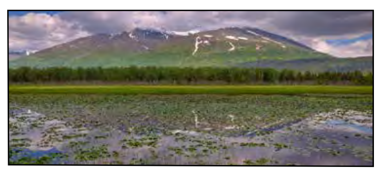
A snow-capped mountain reflecting off a lush green lily pad covered pond on the Kenai Peninsula.

Valdez: Located on Prince William Sound, east of Anchorage, Valdez is home to the terminus of the Alaska Pipeline which transports oil from the North Slope for shipping to markets. It has a stable economy where tourism is growing to compensate for recent declines in the oil industry.