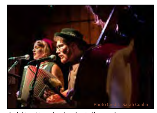
A night out to enjoy dancing to live music.