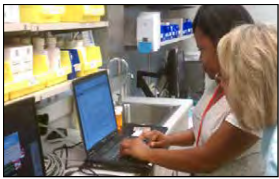
The health care industry is one of the fastest growing economic sectors in Alaska, including the Kenai Peninsula.