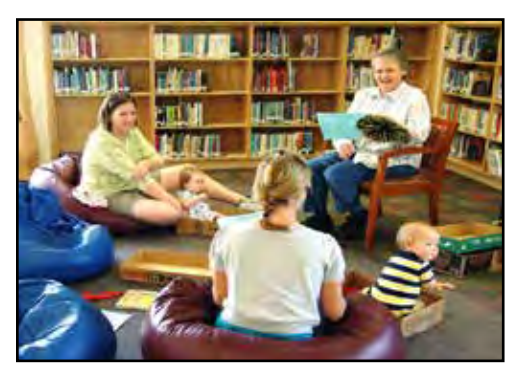
Homer's Public Library features over 36,000 books and a variety of youth and adult activities and programs.