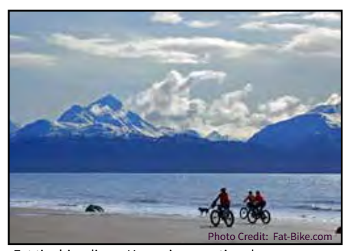
Fat tire bicycling - Homer's recreational opportunities offer something for everyone.