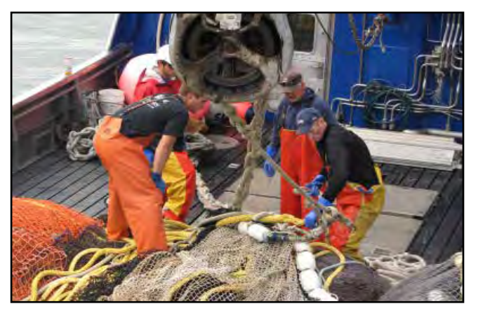
As Alaska's largest private sector employer, commercial fishing is a major contributor to Homer's (and the State's) employment and wages. Comprehensive employment information is available at http://labor.alaska.gov/jobseek/.

Current demands in the residential and commercial real estate markets continue to take construction related industries on an upward trend.