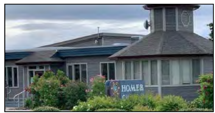
Homer City Hall, 491 E. Pioneer Avenue.

The property tax rate translates to a levy of $1,144 for every $100,000 in assessed value. However, the first $20,000 in value is tax exempt for most residents upon request. Senior citizens (age 65 and older) benefit from an additional exemption on the first $150,000 in value for the City of Homer portion and on the first $300,000 for the Kenai Peninsula Borough portion.