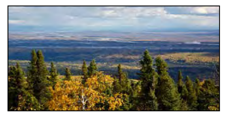
A view of Fairbanks, Alaska and the Tanana River in the Fall.