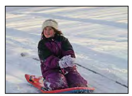
Homer has over 80 km of groomed ski trails, a small downhill ski area with a rope tow and extensive snow machine trails for winter fun.