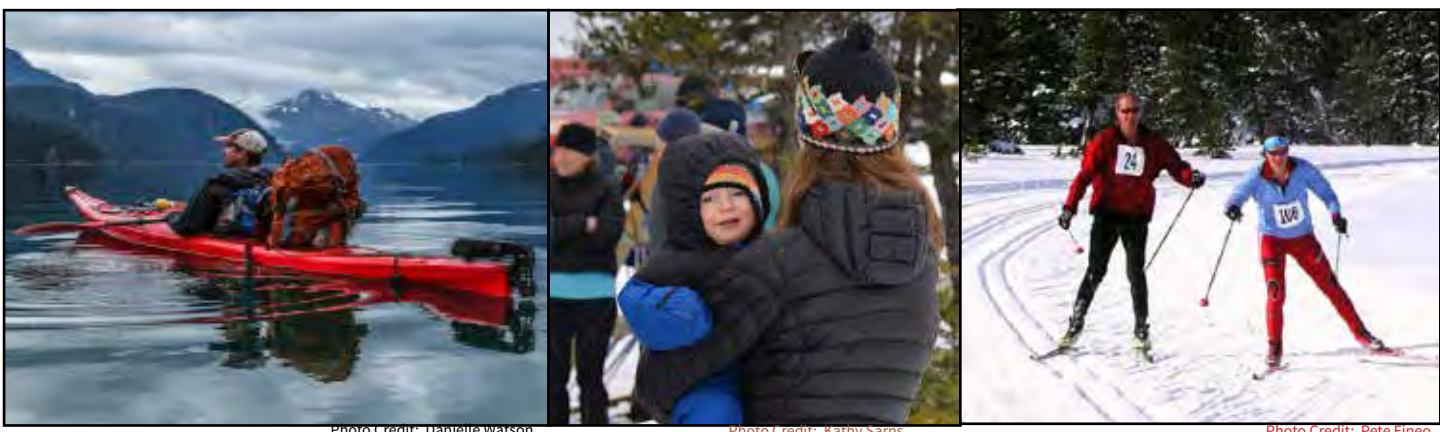
Kachemak Bay, a Natural Estuarine Reserve rich with a diversity of marine life, is a kayaker's paradise.