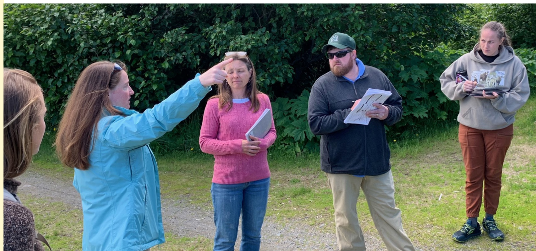
RTCA personnel and City staff toured the western lot on June 21.

A window on the south side of the building shattered during Memorial Day weekend. Security camera footage showed no snowplows at the scene.