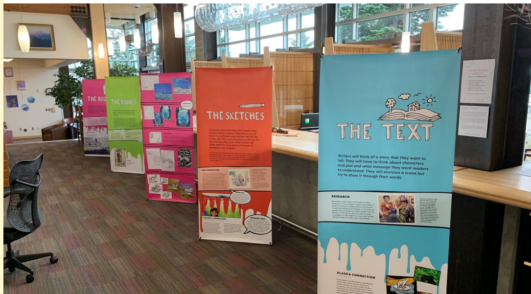
Illustrating Alaska displayed the works of Alaskan artists Nov. 1-Dec. 23.

The Friends distributed book boxes to local schools, part of a long-standing effort to make sure even our most-distant patrons have access to reading materials.