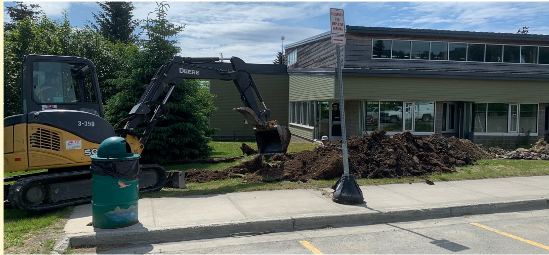
The library's new fiber-optic cable went live on July 22.

Representatives from the RTCA toured the western lot and began the conceptual design work of upgrading the trail.