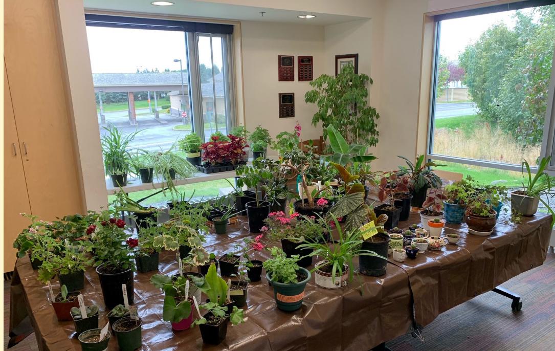
The Friends of the Library Book and Plant Sale delighted customers Sept. 24-25.