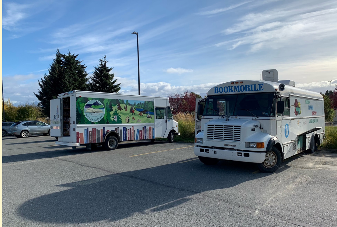
The meeting of the bookmobiles, Oct. 7.