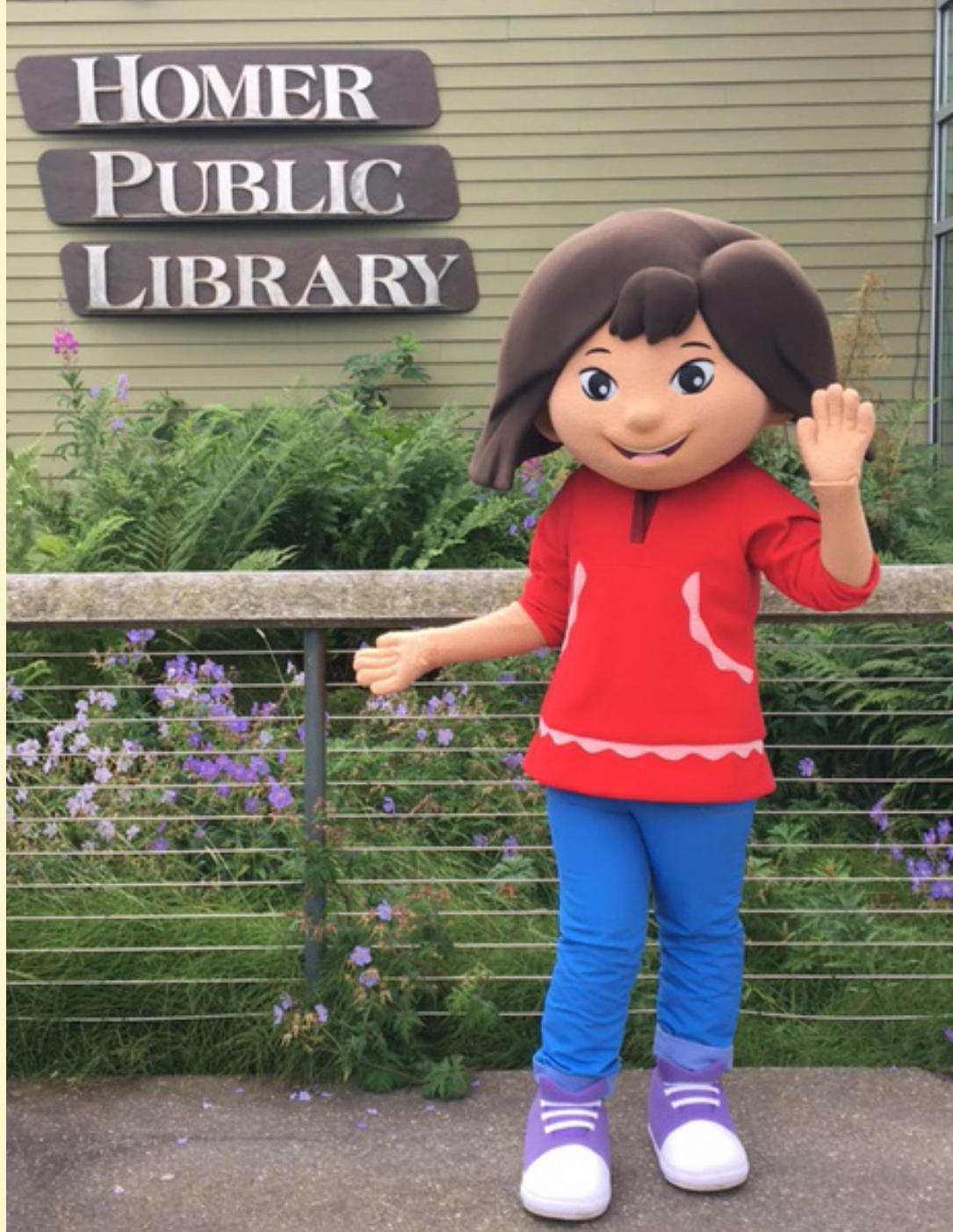
Molly of Denali visited the library on August 9.