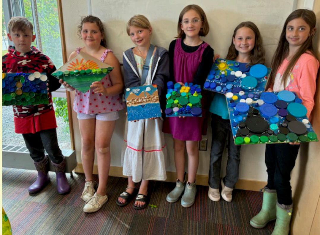
Young mosaicists demonstrated their artworks on July 24.