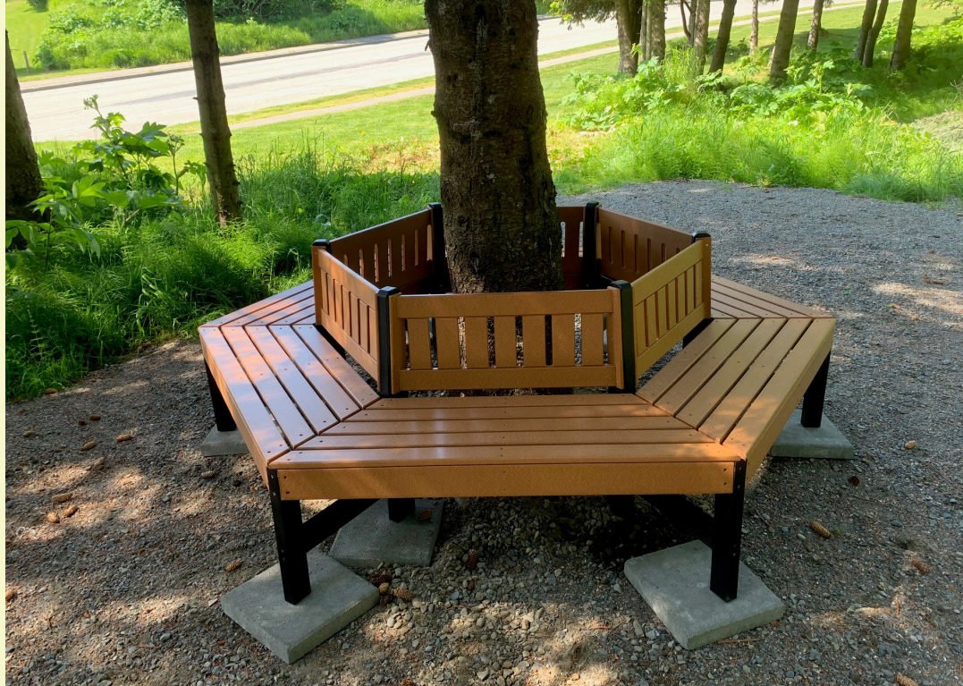
Parks and Trails staff installed the new reading bench on June 18.