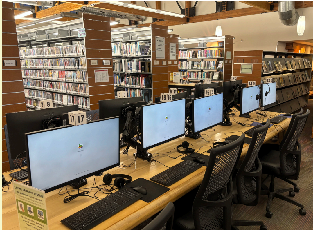
Staff replaced the old public computers in November and December.

The LAB voted to amend the library's privacy policy by adding a section on library communications with patrons.