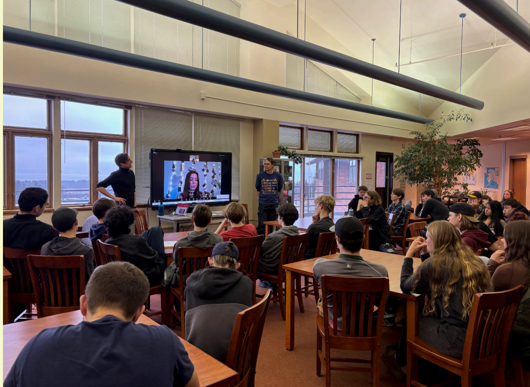
City staff spoke with high-school students about AI on January 22.