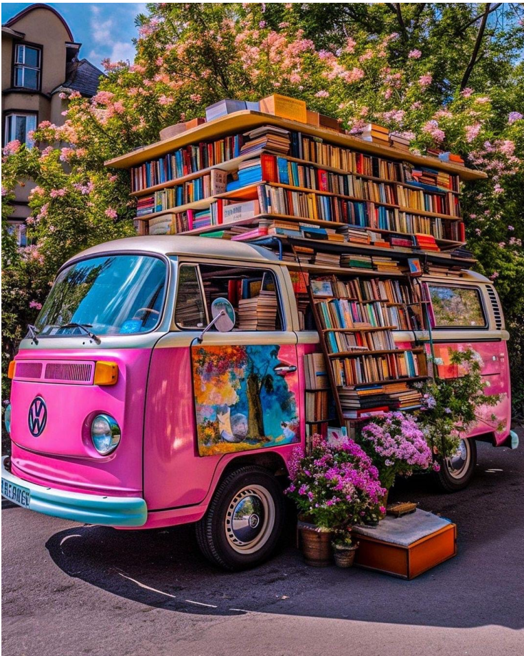
The many faces of Book Mobiles