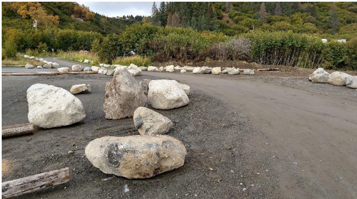
Looking north toward the campground