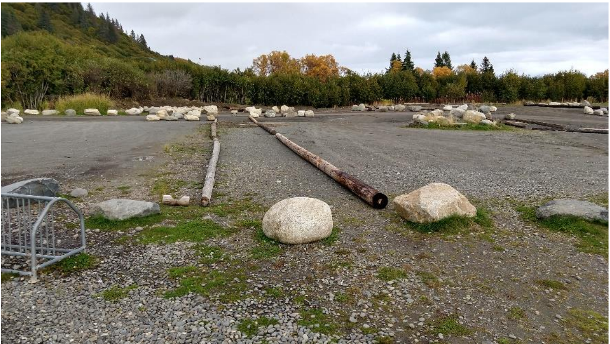
Typical protected pedestrian access corridor