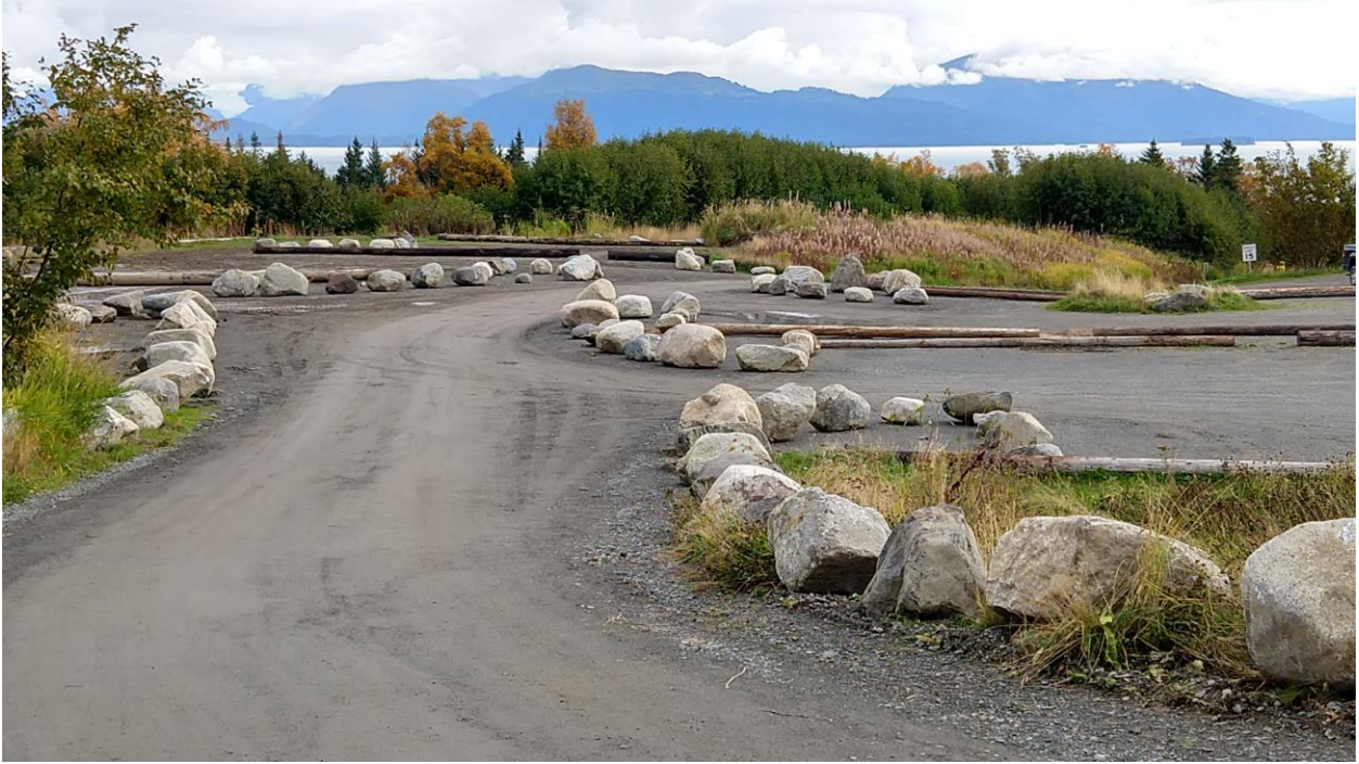
Looking south down the new access road realignment