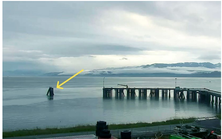
(location of damaged dolphin at the deep water dock)

With a dock face measuring 345 feet, these dolphins serve an essential purpose when mooring vessels that extend beyond the dock's length. The Deep Water Dock is designed to accommodate vessels up to 800 feet long, utilizing both dolphins and mooring buoys for secure moorings. Due to the dolphin's location, the repair will necessitate a vessel equipped with a crane (Complete