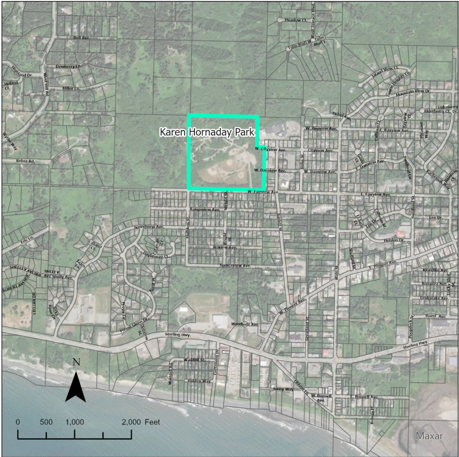
EXHIBIT A LOCATION OF PROPERTY (Section 2.01)