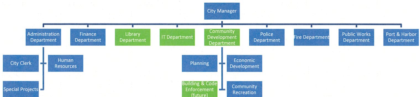
1 - Proposed organizational structure – green denotes new department or proposed future division