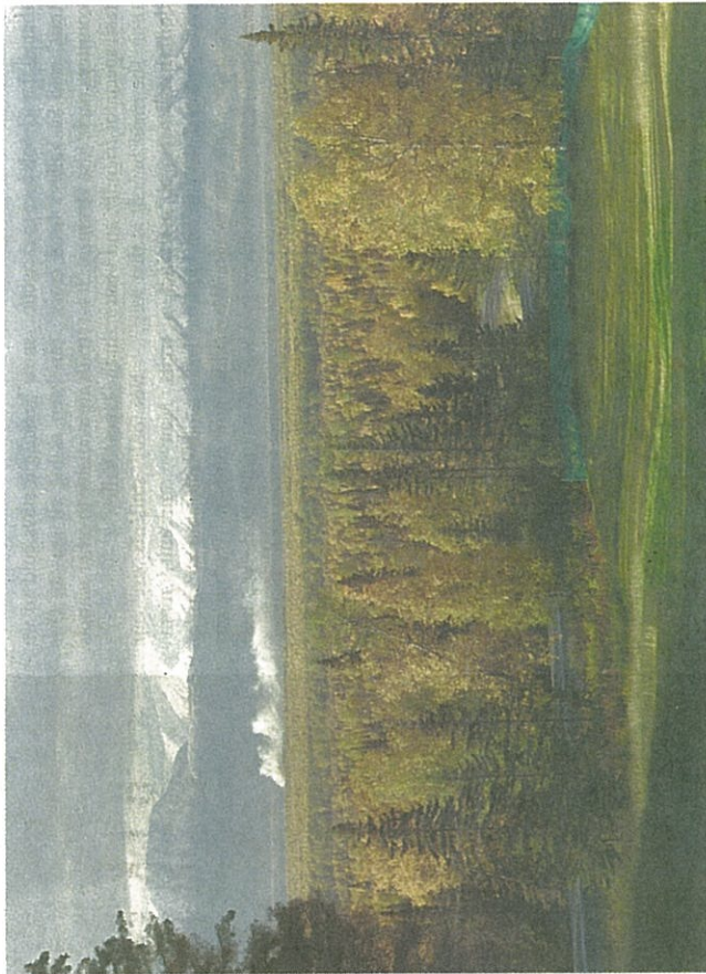
The Government Peak Recreation Area overlooks the Mat-Su Borough in September. The borough is investing in creating new and sustainable trails throughout the Valley with the hopes of generating income as well as quality of life.

Service Southern Research Station has confirmed that trails are an economic boom. They report that in southwestern Virginia, the 34-mile Virginia Creeper Trail generated approximately $2.5 million annually from locals, as well as from visitors. Additionally, the Florida Department of Environmental Protection Office of Greenways & Trails estimates