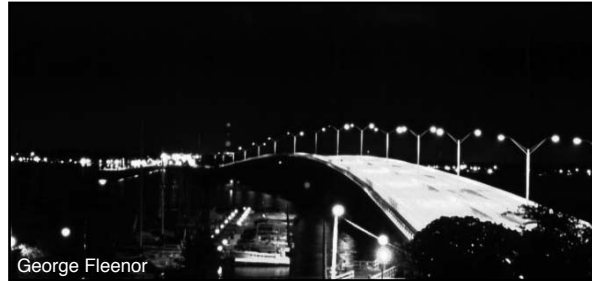
George Fleenor Lighting using fully shielded fixtures reduces glare and expense.

Lights that cause confusion or visual distraction can be deadly while driving. Erratically spaced roadway lights decrease the ability to see a pedestrian or other roadway obstruction. Street lights with noticeable source luminescence, or glare, cause distraction instead of guidance to the driver. Illuminated signs and flashing lights from commercial establishments offer another challenge to concentration. Many cities have enacted bylaws restricting or limiting the use of such devices to improve traffic safety.