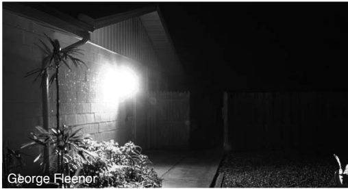
George Fleenor The glare creates deep shadows.

Light for the sake of light does not equal safety. Bright, glaring lights that illuminate some nighttime events and locations can diminish ambiance, but did you know that they can decrease security as well? Overly bright lighting creates a sharp contrast between light and darkness, making the places outside the area of illumination nearly impossible to see. Bad lighting can even attract criminals by creating deep shadows that offer concealment.