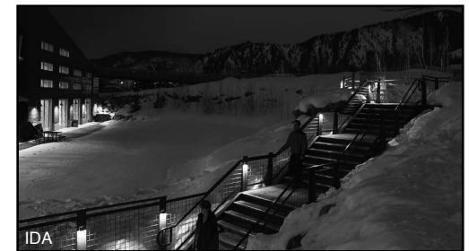
IDA This fully shielded lighting improves ground visibility while preserving the stars.

Effective lighting that helps people be safe, not just feel safe, is a win-win situation for everyone. You can create a safer environment while keeping the night natural.