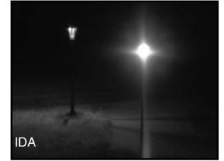
IDA The shielding keeps light on the ground where it is needed.

Lights left on from dusk to dawn provide no alert activity. Installing a motion sensor, or turning off lights and forcing a trespasser to use a flashlight attracts more attention, which is emerging as a more effective way to prohibit property damage.