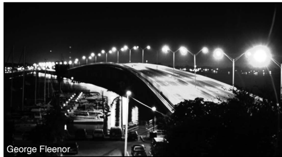
George Fleenor Lighting using drop down glass or plastic lenses can cause unsafe glare.

Lights that cause confusion or visual distraction can be deadly while driving. Erratically spaced roadway lights decrease the ability to see a pedestrian or other roadway obstruction. Street lights with noticeable source luminescence, or glare, cause distraction instead of guidance to the driver. Illuminated signs and flashing lights from commercial establishments offer another challenge to concentration. Many cities have enacted bylaws restricting or limiting the use of such devices to improve traffic safety.