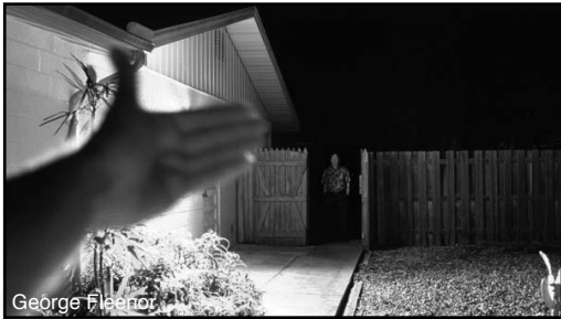
George Fleenor The glare from the light hid a possible attacker.

Light for the sake of light does not equal safety. Bright, glaring lights that illuminate some nighttime events and locations can diminish ambiance, but did you know that they can decrease security as well? Overly bright lighting creates a sharp contrast between light and darkness, making the places outside the area of illumination nearly impossible to see. Bad lighting can even attract criminals by creating deep shadows that offer concealment.